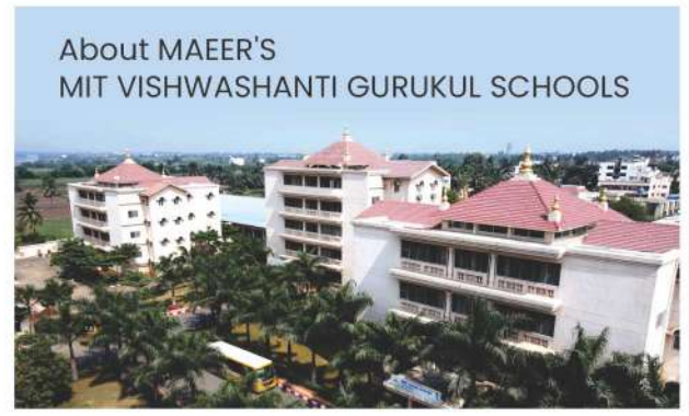
About MAEER'S MIT VISHWASHANTI GURUKUL SCHOOLS

The motto of MAEER is “To harness the knowledge of Science and Technology for the welfare of society”.